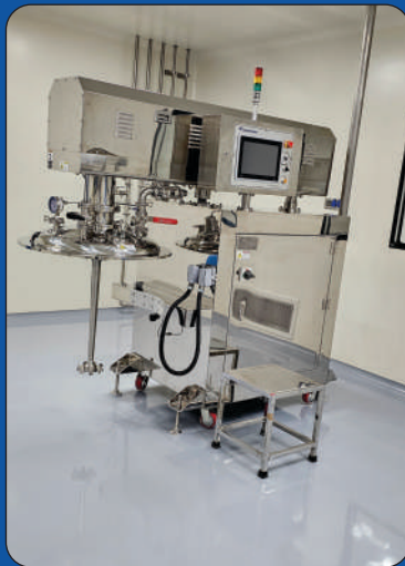
ULTRA FILL MIXER