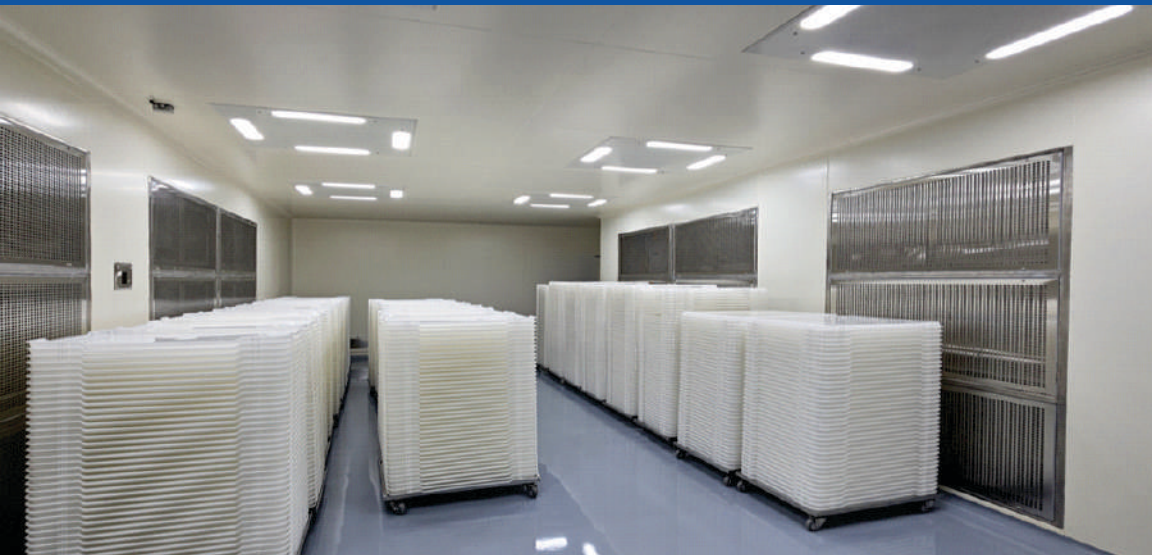
DRYING ROOM (LOW RH AREA) 18±2% RH & <20°C TEMP

Air Handling Units are being placed on roof top and nearer to production area which helps to reduce losses and increase efficiency.